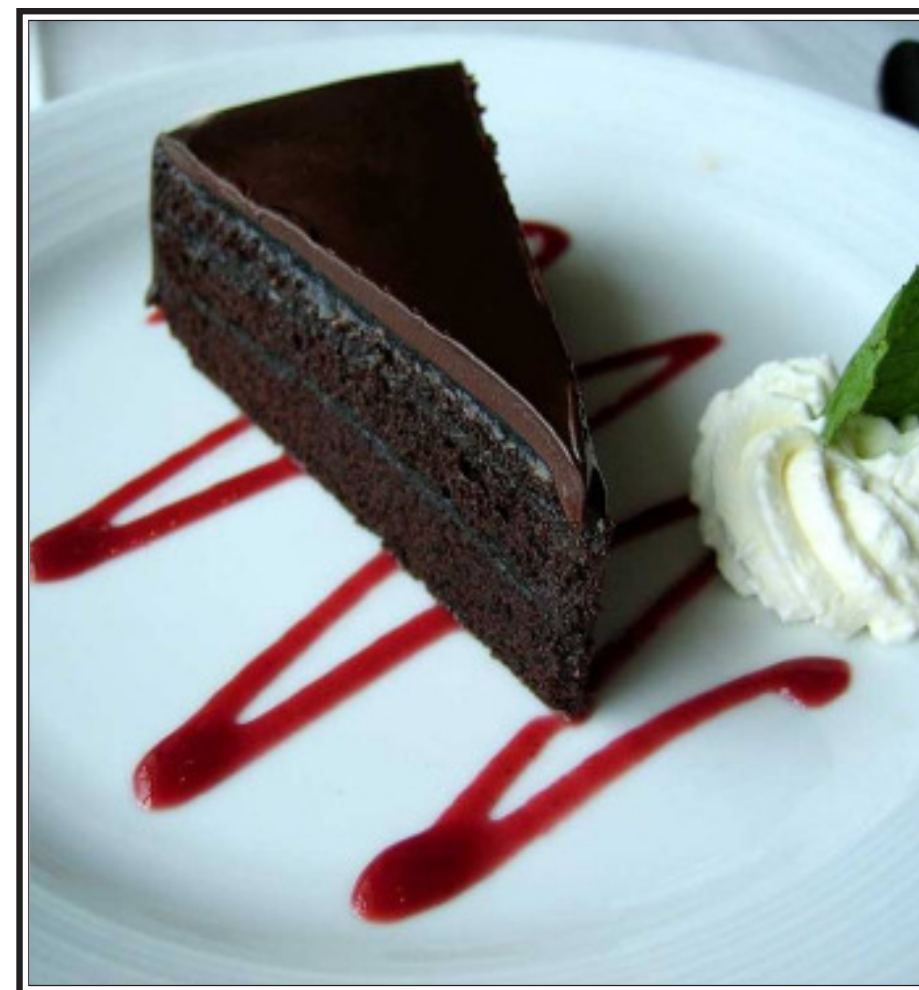
“Chocolate Cake for the Asking”